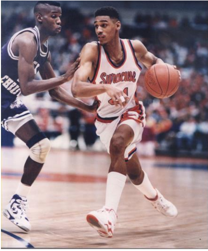
At the Dome!